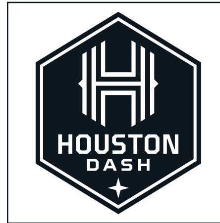
ONE COLOR BLACK VERSION